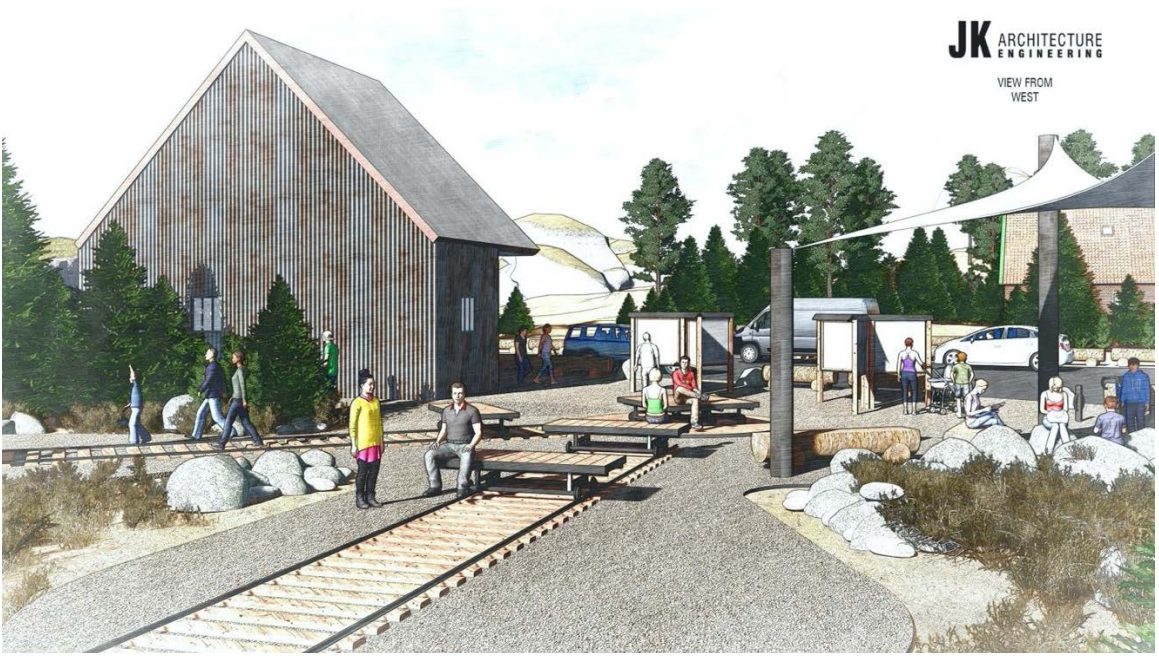
Hub conceptual design by JK Architecture Engineering.

Motions and votes are given in italics ; action items are in red bold . For various reasons, the minutes below do not reflect the strict chronological order of discussions during the meeting.