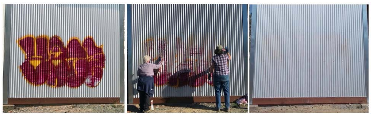
The Shed was tagged in the days leading up to the Graffiti Removal Project.