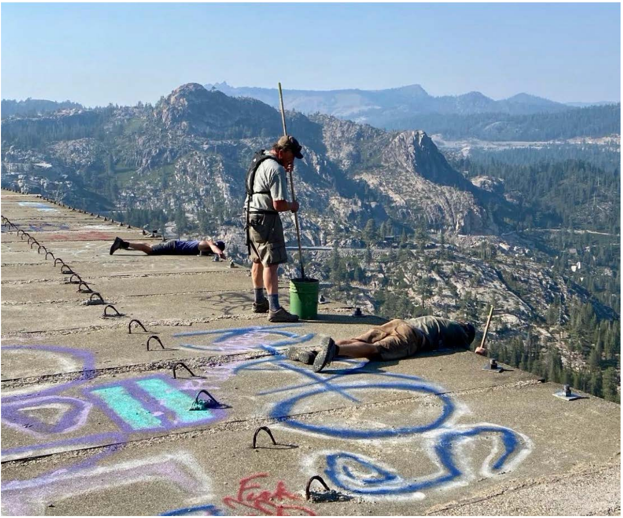
Graffiti removal from the top side of the snowsheds.