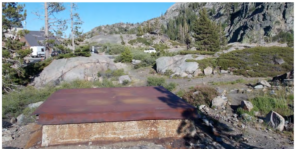
The Shaft and the unpaved path leading back to parking at the Summit Hub (DSCN0592.JPEG)

Motions and votes are given in italics ; action items are in red bold . For various reasons, the minutes below do not reflect the strict chronological order of discussions during the meeting.