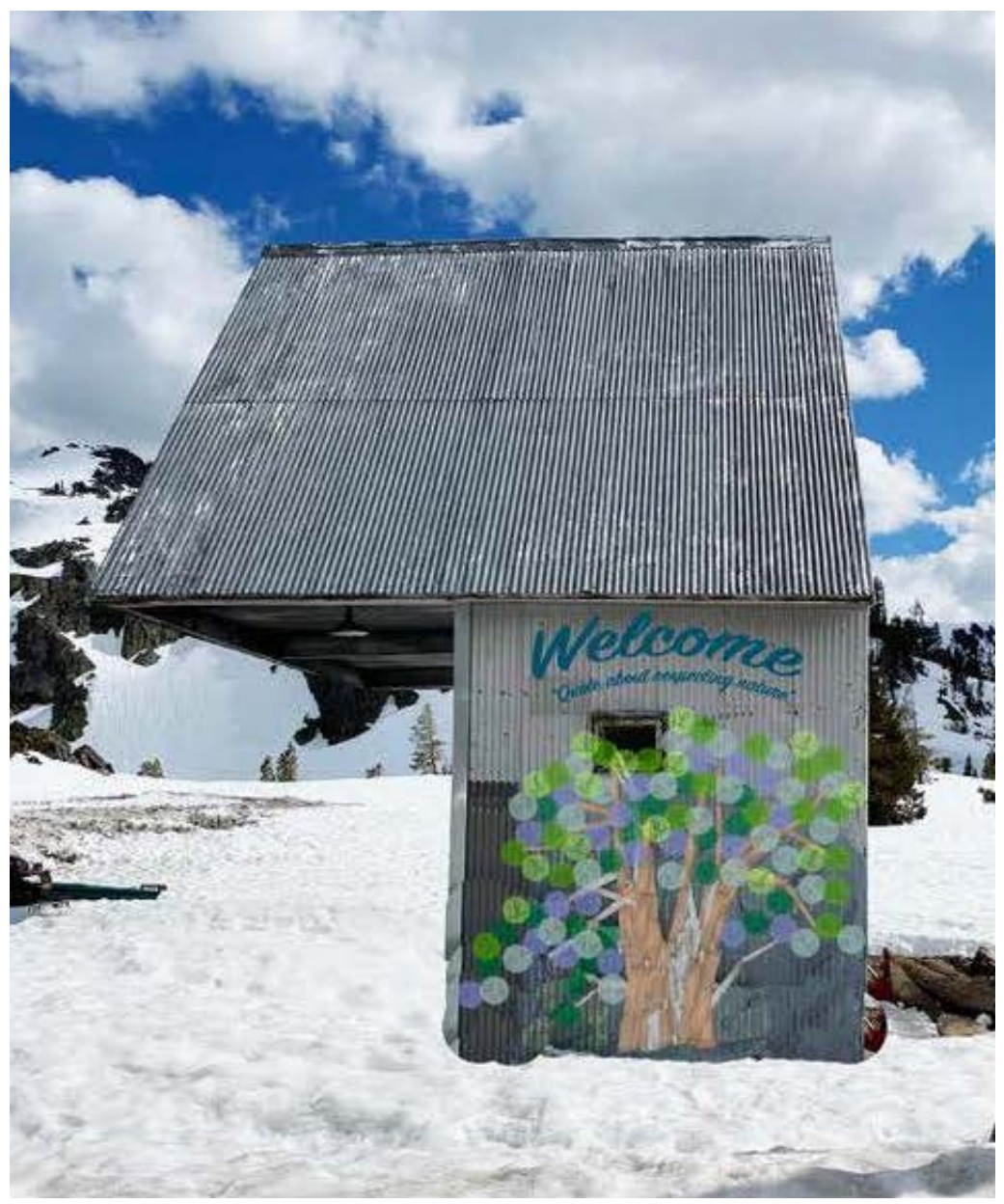
Concept sketch for a mural on the side of the Shed. Circular 'leaves' can be created from varying colors of glass and imprint drawings from the students at Donner Trail Elementary School (provided by Anne-Flore Dwyer).

Pat and others collected legacy lumber for the Shed project from the collapsed garage across the road. Anne-Flore said the recycled 2x6s from the garage could be used as parts of the bench assemblies or the portable toilet enclosure. Several long large beams (10x10s) could also be used for benches and the enclosure. Miscellaneous siding materials could be used for the proposed mural.