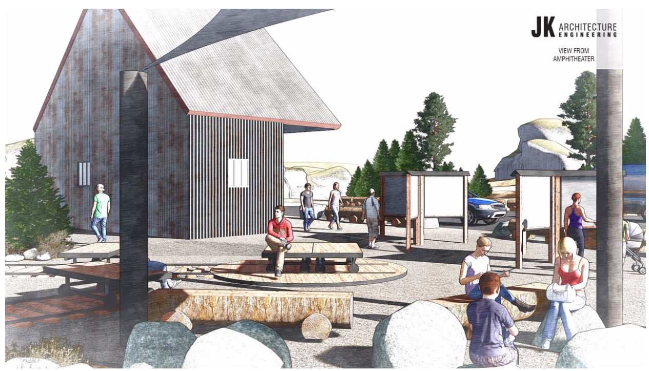
Close-up of seating area.

DONNER SUMMIT ASSOCIATION P.O. BOX 674, SODA SPRINGS, CA 95728