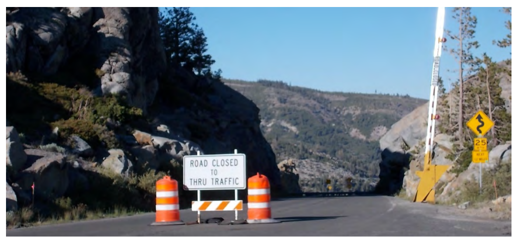
Signage at the Summit after the first day of closure on Donner Pass Road (DSCN0584.JPEG).

there has been a drainage problem at that spot; the work will result in a widened road there with better drainage.