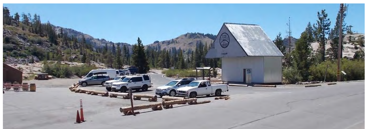
Summit Hub area from Donner Pass Road (DSCN0739.JPG)

Motions and votes are given in italics ; action items are in red bold . For various reasons, the minutes below do not reflect the strict chronological order of discussions during the meeting.