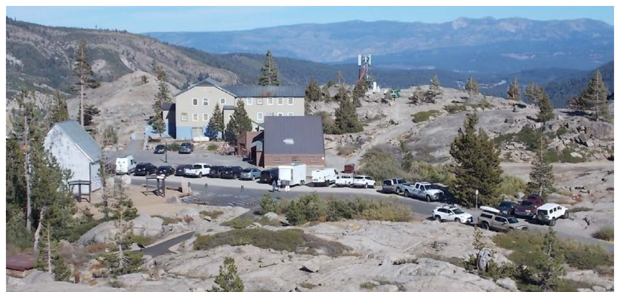
The Hub on a Thursday afternoon (September 24) (DSCN0948.jpg)

Motions and votes are given in italics ; action items are in red bold . For various reasons, the minutes below do not reflect the strict chronological order of discussions during the meeting.