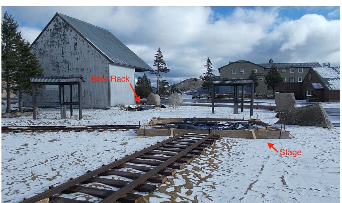
5. Reports from Ongoing Projects, and Proposals for New Projects: