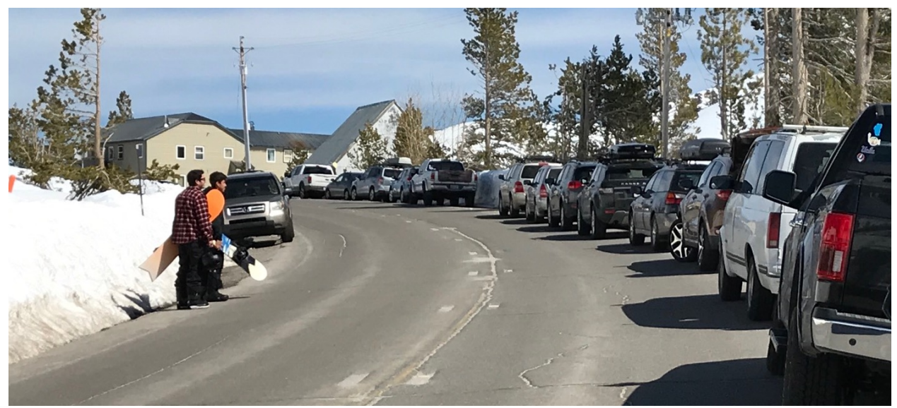
Shelter-in-place on Donner Pass Road, April 10 (IMG_2087.jpg).