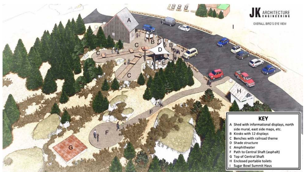
Figure 1 – Overview of The Summit Hub project area (base drawing by JK Architecture; adapted from a labeled version by Bill Oudegeest).

history in the Summit area. The Design Committee is looking for people with interest in railroads to help locate materials; Pat has tried to contact the Applebaums in Soda Springs, but they have not responded. Wheels and axels have been priced at $4K each; this is out of budget, so Chris is looking for scrap that can be rehabilitated.